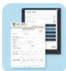
API Developer site